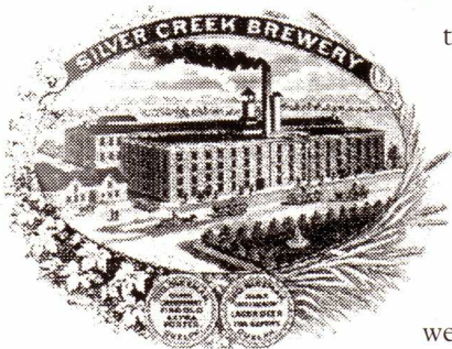
The Silver Creek Brewery in its heyday in the late 1800s. The company was part of the Sleeman family brewing empire.

We do admit that today's 341 ml (12 ounce) bottle is not quite the same bottle of times past. For obvious reasons, we encourage moderation, as opposed to back then when anything less than a 16 or 20 ounce serving was an insult! But