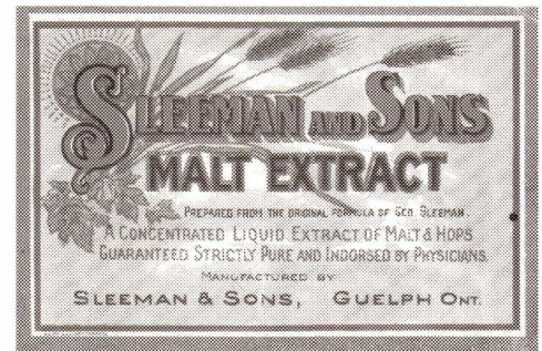
Malt extract produced by the Sleeman family in the late 1800s and used for medicinal purposes.